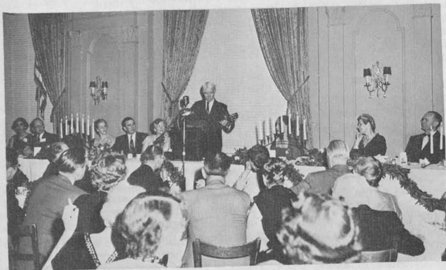
Carl Sandburg, NCLA Convention, Asheville, October 23, 1953.

Many people make up this Association. All have contributed their fellowship and hard work to the profession. We salute them here now, all of them, whether their names or faces actually appear. We all know that it's the people who make the difference.