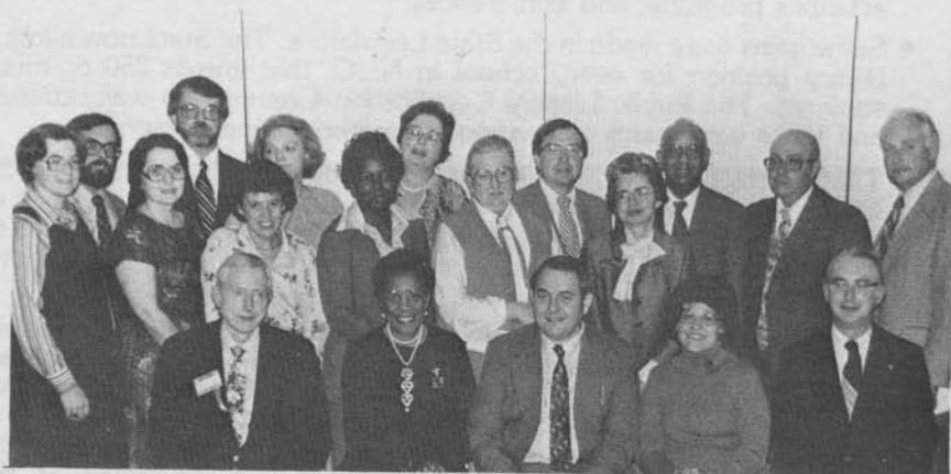
NCLA Executive Board, 1977-79.