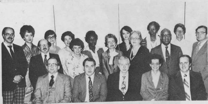
NCLA Executive Board, 1979-81.