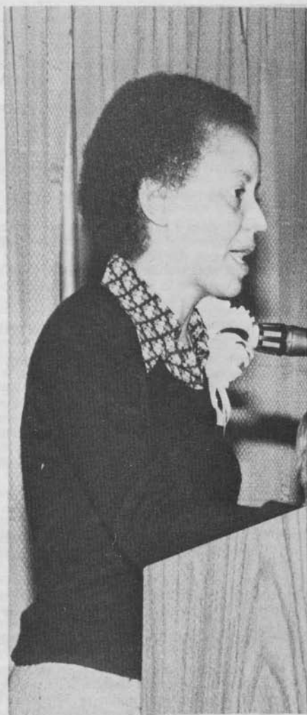
Nikki Giovanni, principal speaker, banquet.

All together—writers, publishers, teachers, parents, librarians—we owe it to her. All together we share the responsibility for what she can know and therefore for what she can become. When we limit her imaginary world, we also limit her real world. Our obligation is not to set the limit but to broaden the horizon. No matter where the story travels, into the past or the future, a fantasy world or next door, we must let her go. We should not expect a safe and easy journey, but be mindful of the experience reading brings: the chance to see, to imagine, to know.