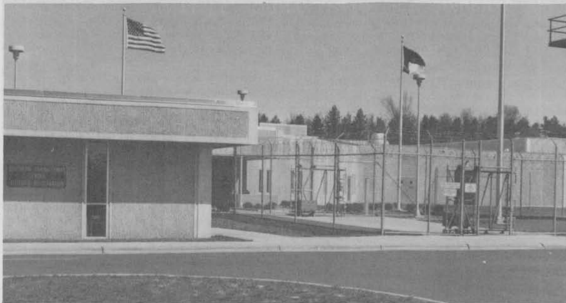
Southern Correctional Center in Troy.