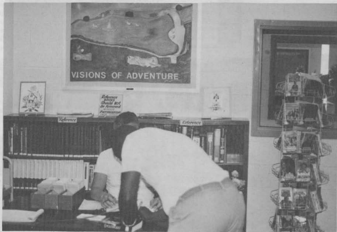
An inmate prison aide checks out materials to another inmate at Southern Correctional Center Library.

Magazines accounted for 35% of the total print circulation. No record is kept of newspaper use.