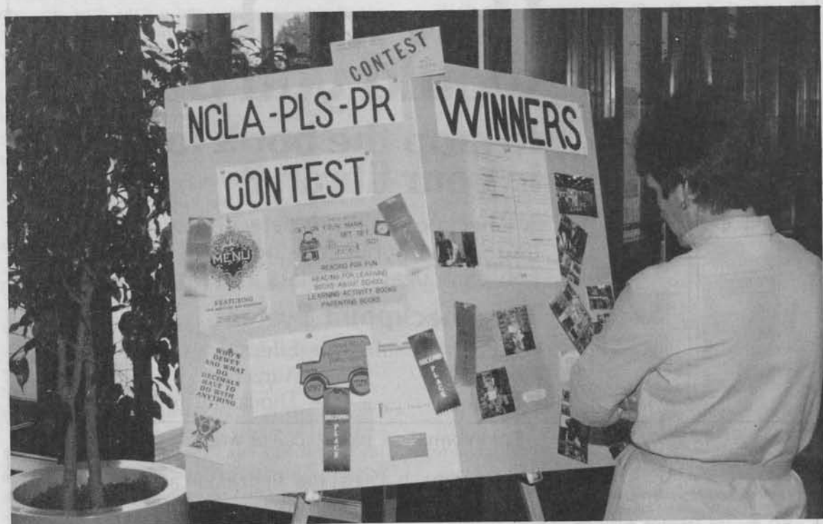
The Public Library Section's PR contest featured winning displays and printed pieces.

What I am saying is that the implications of today's economic and political climate reveal to me a dynamic future for the library profession. The long-term survival of America, the national security of our country, is dependent on a new