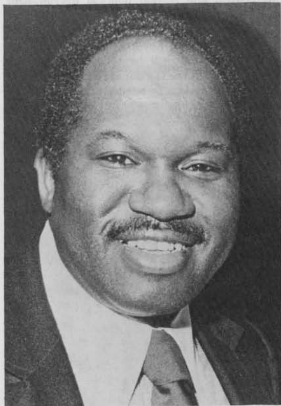
Speech delivered by Congressman Major R. Owens at the biennial conference of the North Carolina Library Association, October 4, 1985, at the breakfast sponsored by the Round Table on Ethnic Minority Concerns and the Round Table on the Status of Women in Librarianship.

To facilitate understanding, let's simplify matters and focus on one key political situation, one set of dominoes in a casino filled with domino games. Let's focus on the basic question of