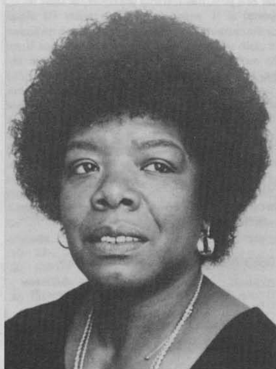
Maya Angelou will be one of the featured speakers at this year's NCLA Conference to be held in Winston-Salem October 28-30.