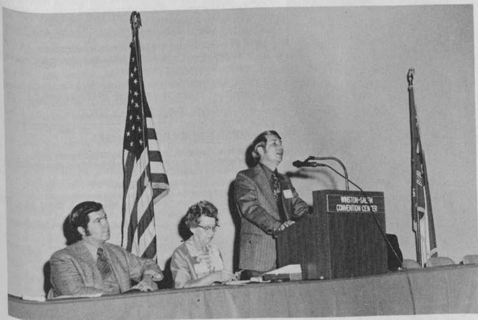
"Heute North Carolina, Morgen die ganze Welt!"