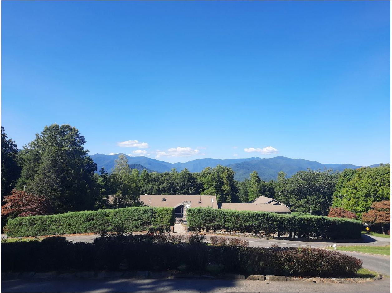
Image 1: Leadership Institute Site, the Blue Ridge Assembly YMCA campus in Black Mountain, North Carolina

Driving up the steep, winding road of the Blue Ridge Assembly YMCA campus in Black Mountain, North Carolina, for the first time is nothing short of breathtaking and, at the same time, a bit daunting for what lies ahead for the librarian traveler. Every other year, the North Carolina Library Association (NCLA) hosts the Leadership Institute. This unique program includes an intensive four-day retreat that turns into a year-long leadership project at the participant's home library. Although established in the 90s, the Leadership Institute has gone through much change, including a lengthy hiatus, in its thirty-year tenure.